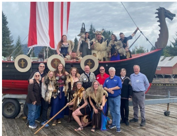
Zone 6 Meeting in Fairbanks Alaska